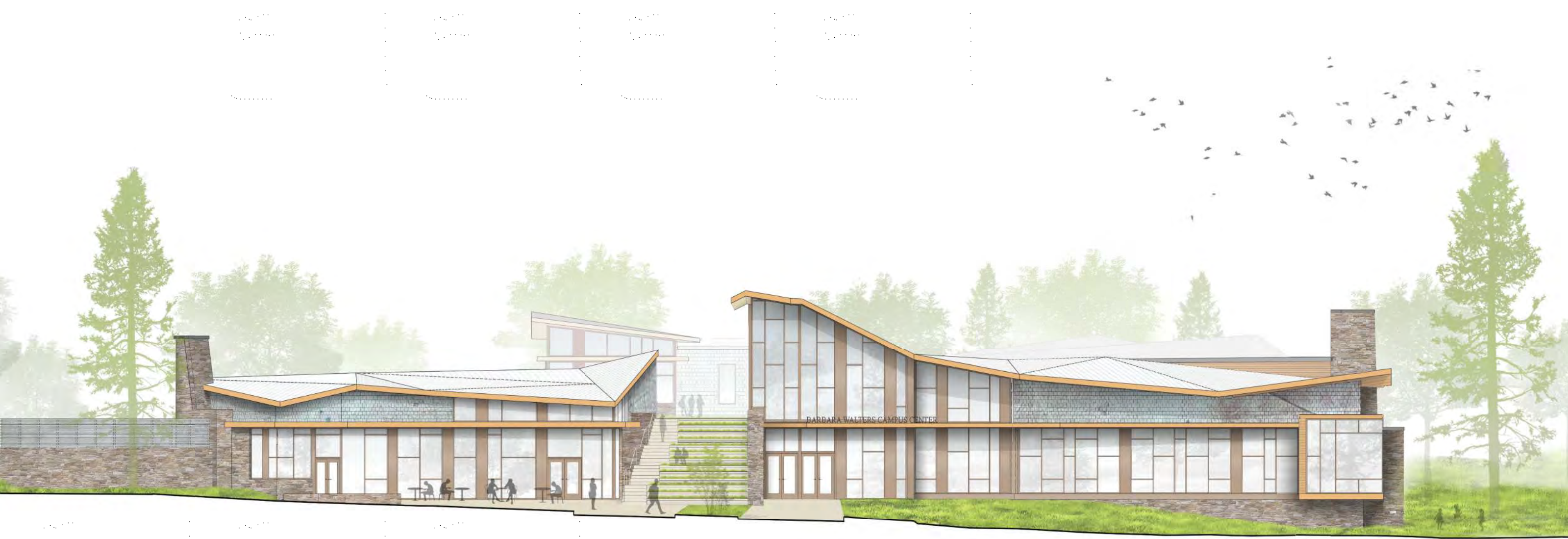
VIEW FROM GLEN WASHINGTON ROAD